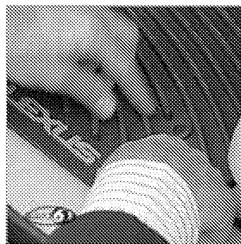
When the winter floor mat is put on top of the regular one, there's no way to hook it.

That floor mat evaluation report shows three crashes so far and seven injuries regarding this issue.